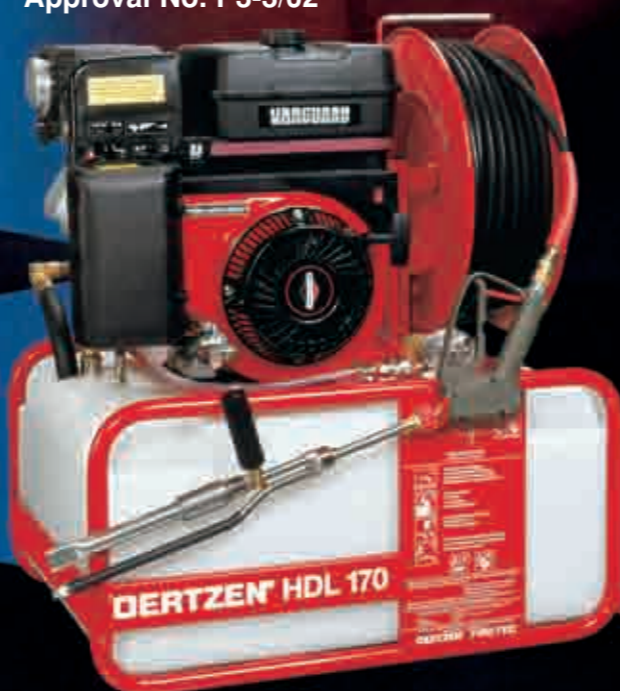
HDL 170 universal unit with 100 liter tank for fixed installation Approval No. P3-3/02