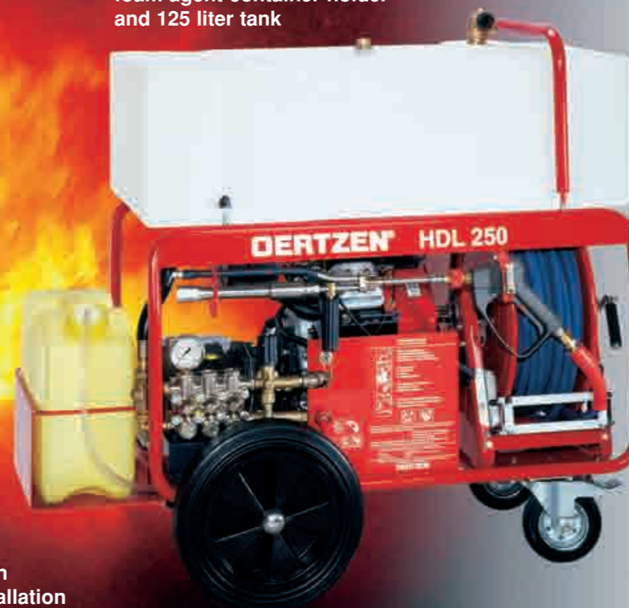
HDL 250 mobile with chassis, foam agent container holder and 125 liter tank