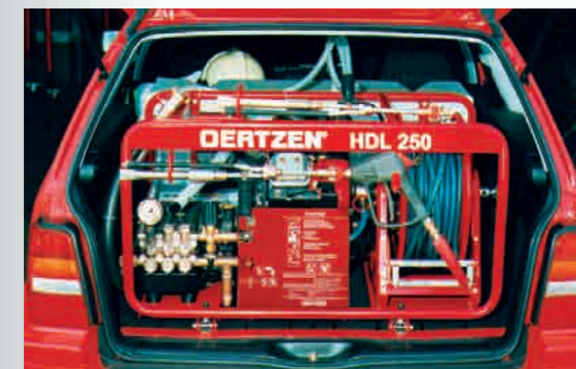
HDL 250 as compact installation unit installed in a small car with 125 liter tank in front of it.