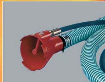
Sludge Pump pumps liquids and solids up to 20 mm diameter P/N 10.800.411