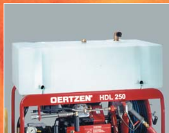
Tank Kit 125 Liter white P/N 10.000.998