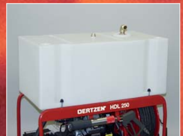
Tank Kit 175 Liter white P/N 10.000.970