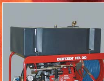
Tank Kit 125 Liter dark grey to suppress algae P/N 10.000.747