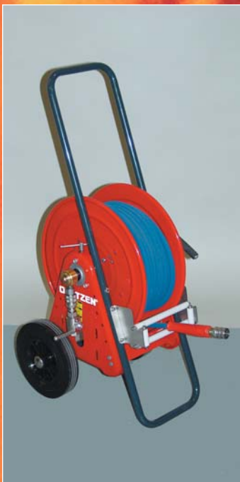
Hose Reel Trolley for extending the extinguishing hose by 60 m P/N 10.000.986