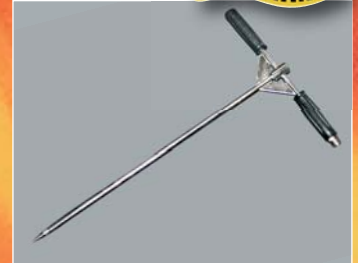
Fog Lance for inaccessible glowing fires P/N 10.000.787