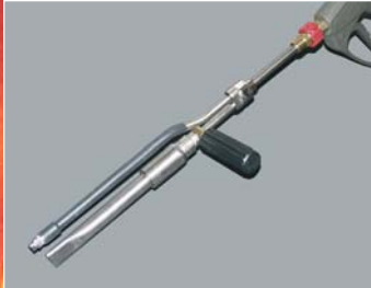
DUPLEX Attachment for spray and low expansion foam P/N 10.000.973