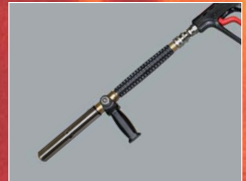
VARIO Lance cone stream nozzle for wide throw, spray and low expansion foam P/N 10.000.886