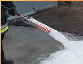
Medium Expansion Attachment for fighting against glowing dust and similar P/N 10.000.765