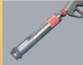
TRIPLEX Attachment for spray, throw and low expansion foam P/N 10.000.895