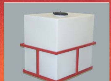
Tank Kit 360 Liter white P/N 10.000.755